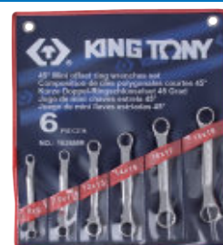
► Nylon pouch bag