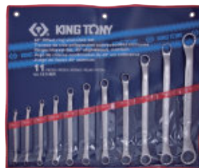
► Nylon pouch bag